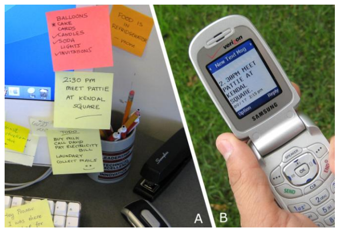
Figure 1. (A) Sticky notes at user's desk (B) Example of a reminder sent to user's mobile phone.

IUI'08, January 13-16, 2008, Maspalomas, Gran Canaria, Spain. Copyright 2008 ACM 978-1-59593-987-6/ 08/ 0001 $5.00