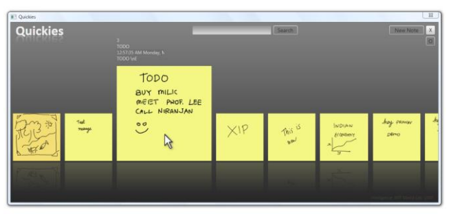
Figure 3. Graphical user interface of the 'Quickies'.